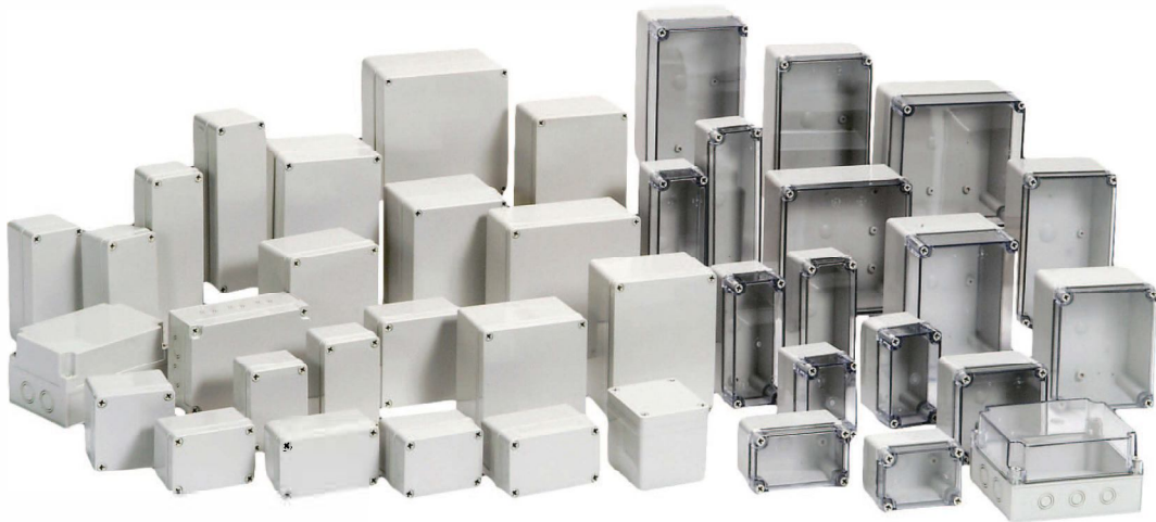
S Design / S 디자인 / S 设计 50x60x45 ~ 210x230x100mm