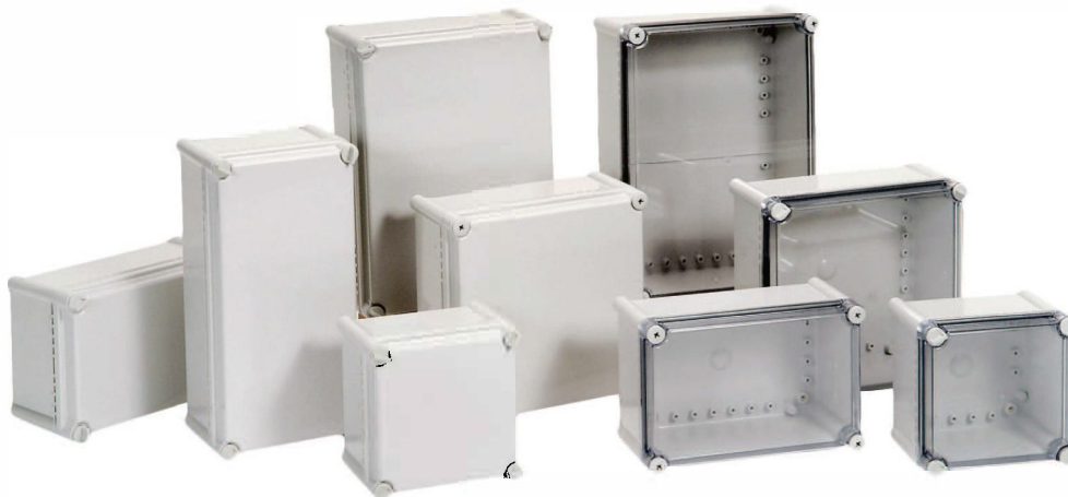
M Design / M 디자인 / M 设计 190x190x130 ~ 380x560x180mm